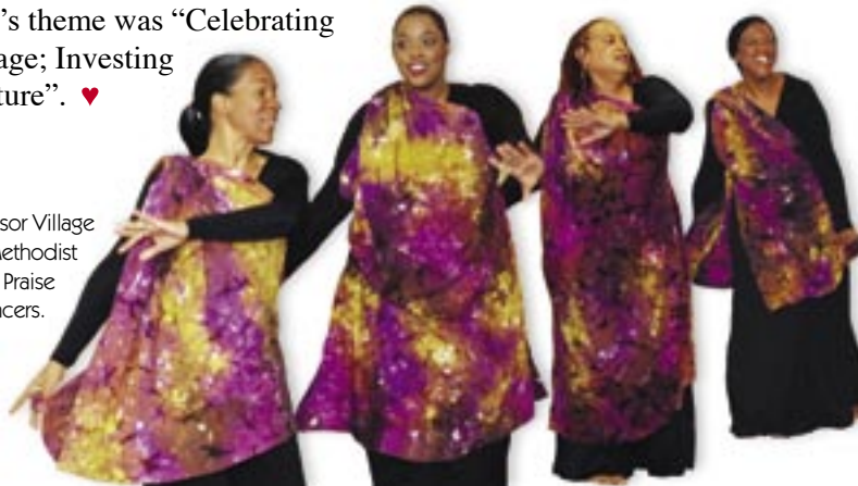
Windsor Village United Methodist Church Praise Dancers.

This year's theme was "Celebrating our Heritage; Investing in our Future". ♥