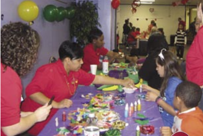
Staff entertain children available for adoption during the 4th Annual Hearts for CPS Children Adoption Festival.